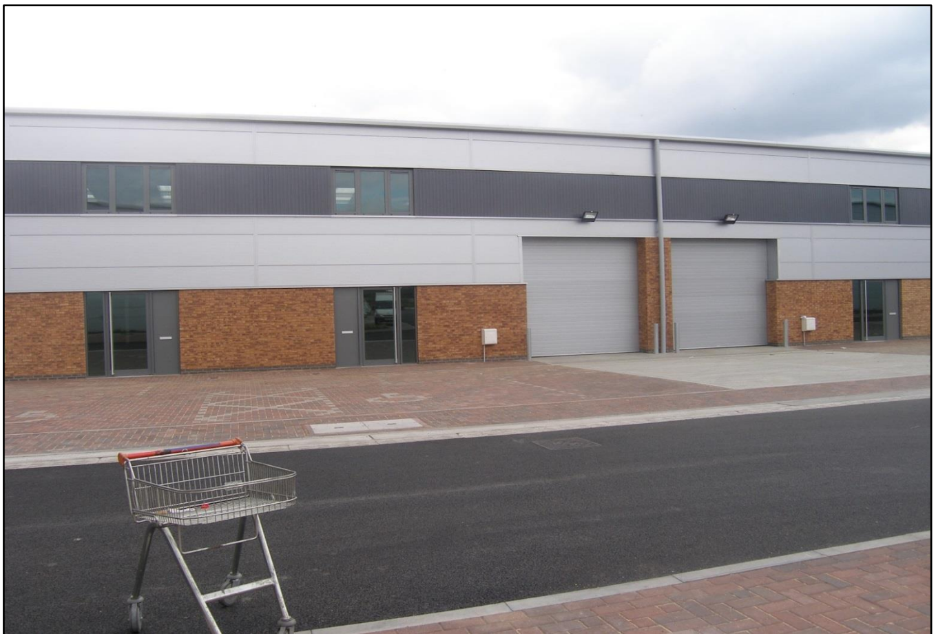
Historic indicative photograph