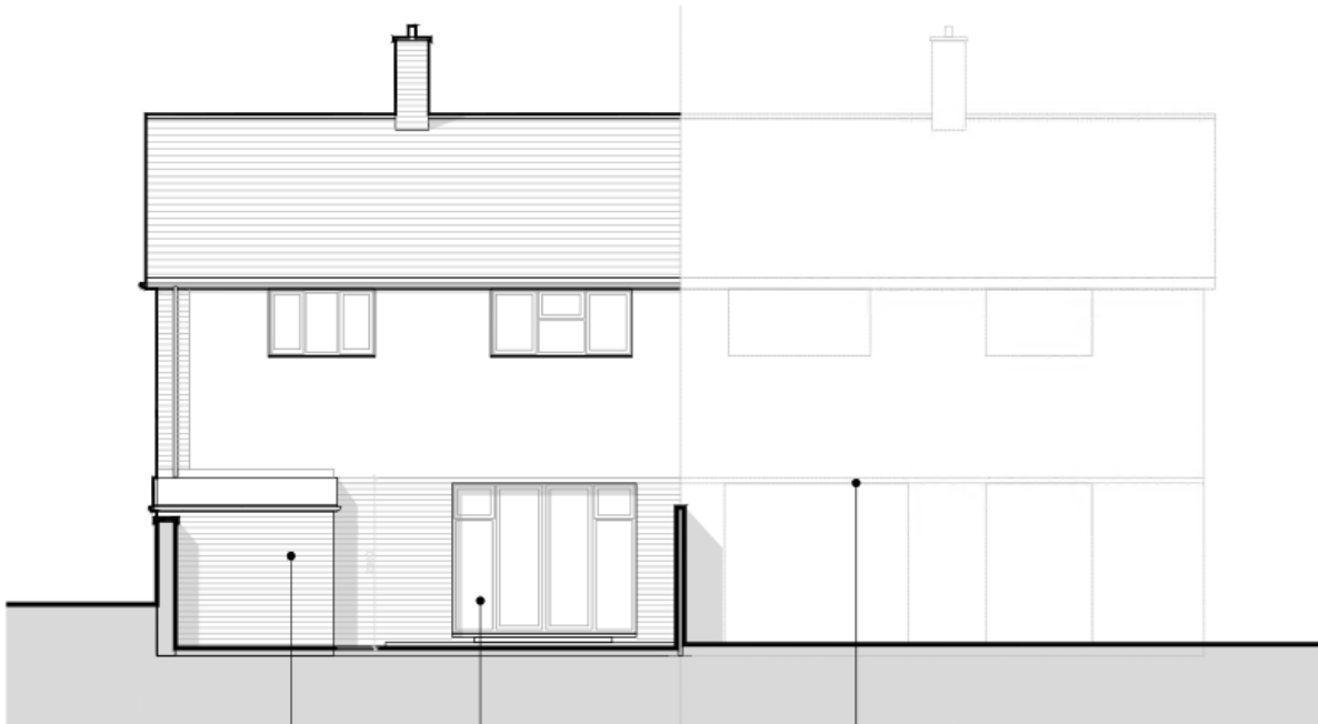
(SE) EXISTING SOUTH-EAST ELEVATION

Existing brick single storey storage building