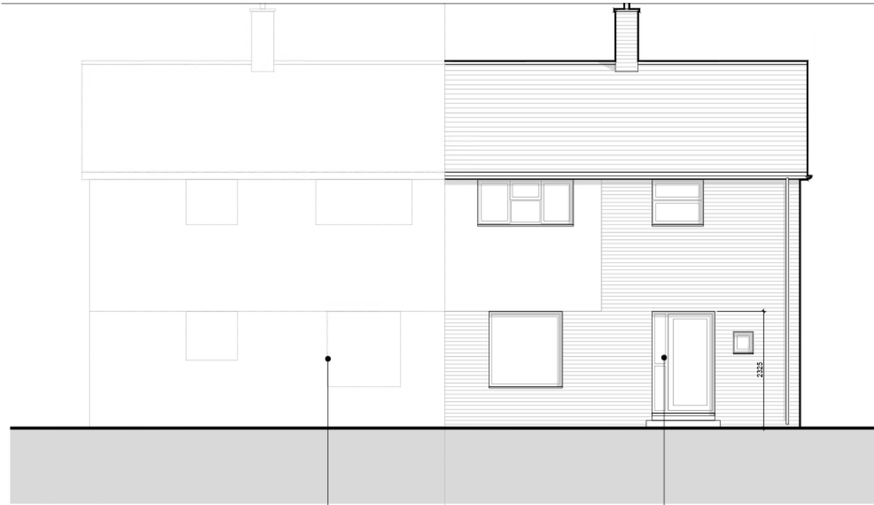
(NW) EXISTING NORTH-WEST ELEVATION