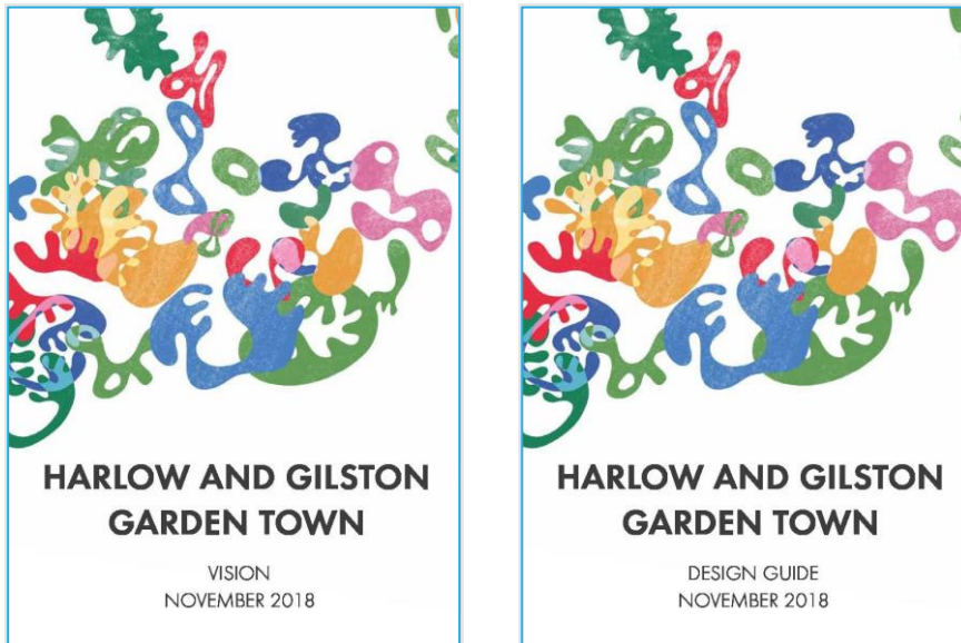
Figure 2 Harlow and Gilston Garden Town Vision and Design Guide

The Sustainable Transport Corridors are a key element of the infrastructure required to integrate the Garden Town Communities with the built-up area of Harlow and achieve the aim to make walking, cycling and public transport the most attractive option in line with Garden City Principles. A Transport Strategy 34 has been produced setting out objectives for achieving sustainable travel.