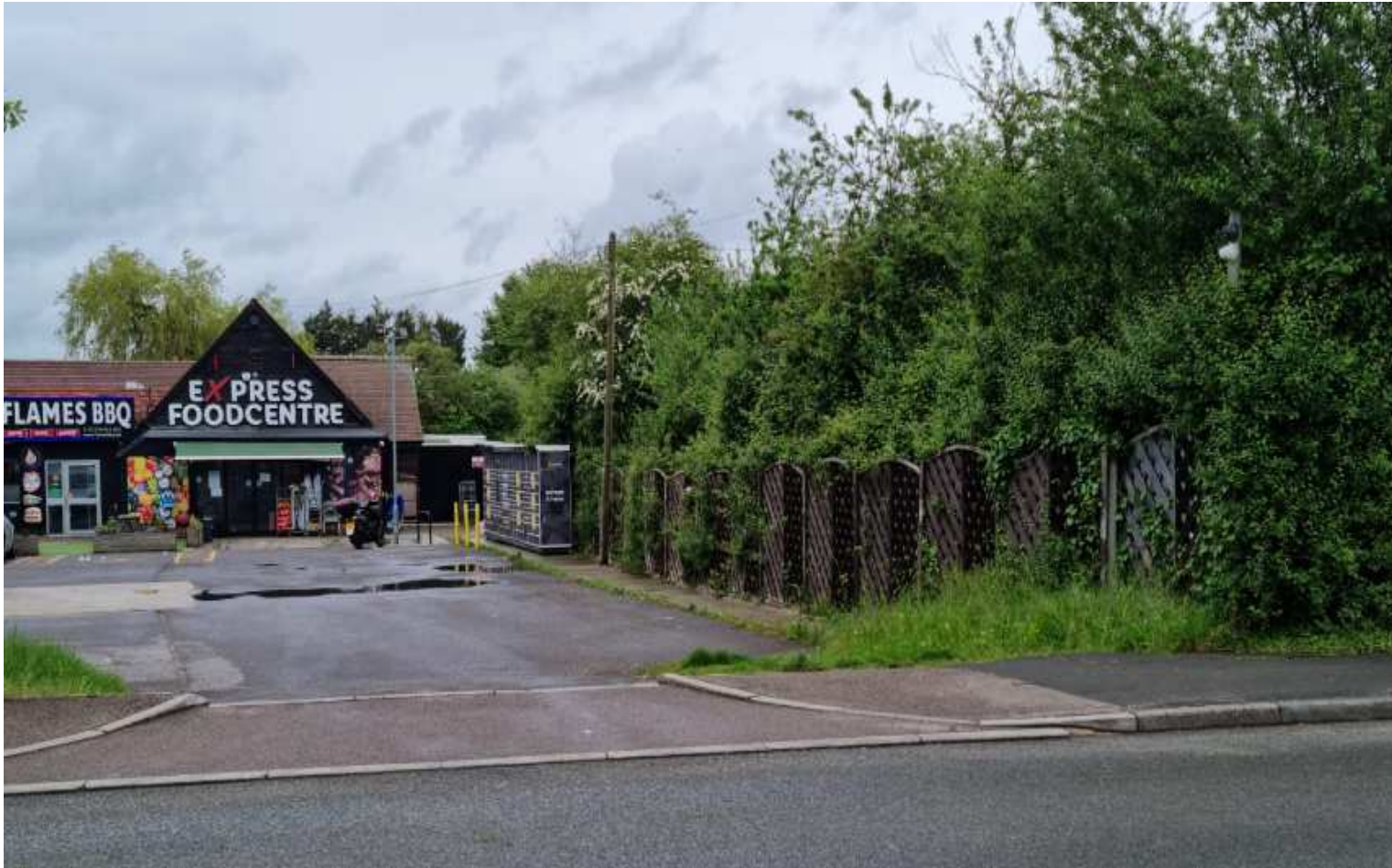
Rear boundary from site to west