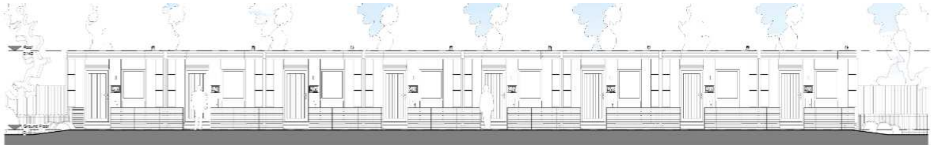
Front Elevation (East)