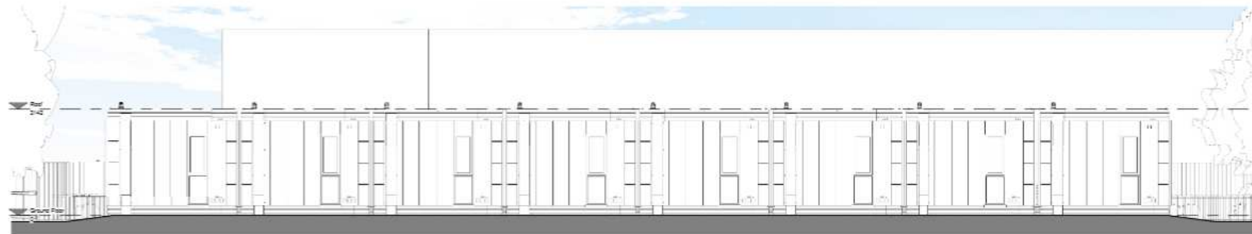
Rear Elevation (West)