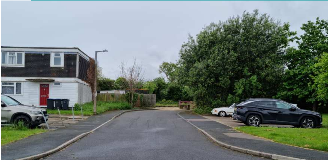
Access road to site