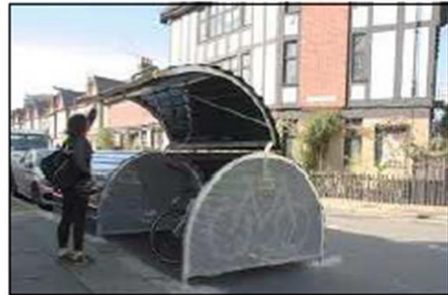
Barrell Style Cycle storage (green finish)